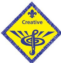
The Creative Challenge