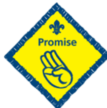
The Promise Challenge