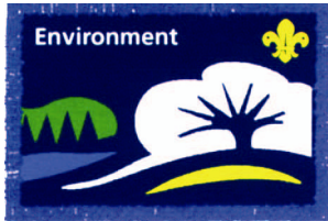
The Environment Award