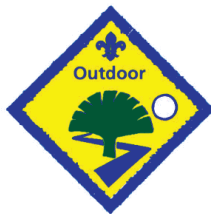
The Outdoor Challenge