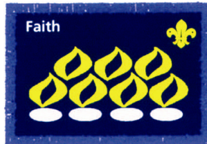
The Faith Award