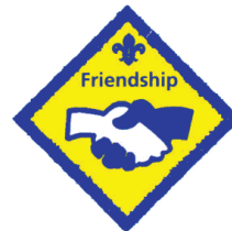
The Friendship Challenge